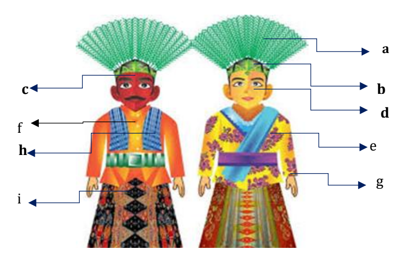
Figure 2. Betawi Ondel-ondel

The description of the Ondel-ondel visual image above contains the symbolic meaning of the city of Jakarta, namely: