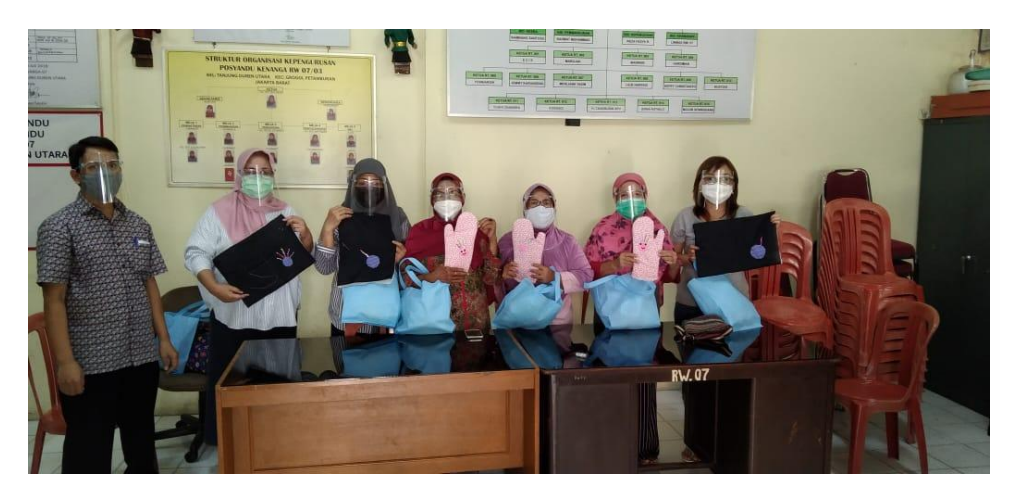
Figure 7. The final result of the community service activity training