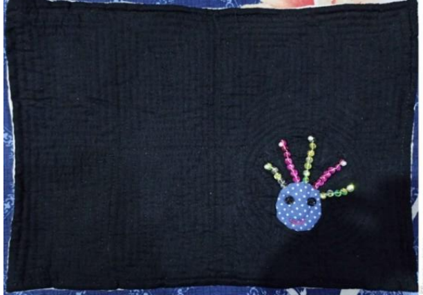
Figure 3. Placemate Patterns and Finishes

b. Gloves for cooking, one side is given the application of the doll's face 'Ondel-ondel', the front and back motifs are cotton fabric, while the inside is lined with dacron and the last layer is cotton calico. Here's the pattern and the final result: