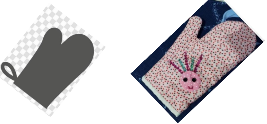
Figure 4. Gloves for Cooking, Patterns and the finish

b. Gloves for cooking, one side is given the application of the doll's face 'Ondel-ondel', the front and back motifs are cotton fabric, while the inside is lined with dacron and the last layer is cotton calico. Here's the pattern and the final result: