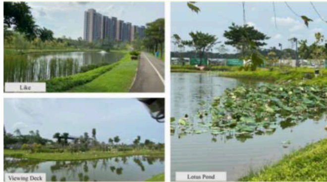
Figure 5. Green Land Zone