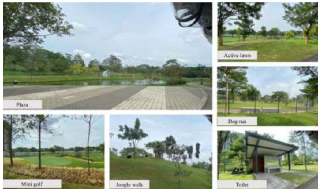
Figure 5. Meandering River Zone

Figure 5 establishes that the Meandering River Zone has done quite well. However, it could still benefit from further improvements. Just like the Serenity Lake Zone, facilities such as fountains and drinking fountains could be added for extra appeal. It is also crucial to enhance the irrigation and drainage systems by installing biopori or infiltration wells to ensure that water is infiltrated before being poured into the lake. A more diverse vegetation, microclimate features such as tall trees with broad leaves, attentive lighting, signages as well as more trash bins could encourage visitors to stay longer in the Meandering River Zone.