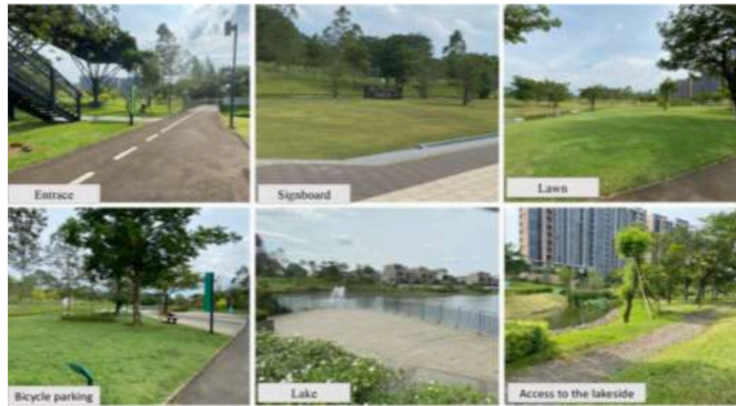
Figure 4. Serenity Lake Zone

Figure 4 shows that the condition of the Serenity Lake Zone is quite good, but it still has room for improvement by adding visual landscape elements, such as fountains as well as drinking fountains. These could provide an identity and a good image for the zone. Arrangement of the vegetation could be more thoughtful, incorporating plants with different colors of flowers to enhance the zone's aesthetics and attractiveness for visitors. Tropical trees that grow tall with broad leaves could also be valuable to control microclimate in the zone. Furthermore, it could benefit from better and lovelier lighting to provide interesting landscape attractions at night. The zone could install signages to clearly divide facilities such as the jogging track, the cycling track, and pedestrian track. Last but not least, more trash bins that are strategically placed are also needed.