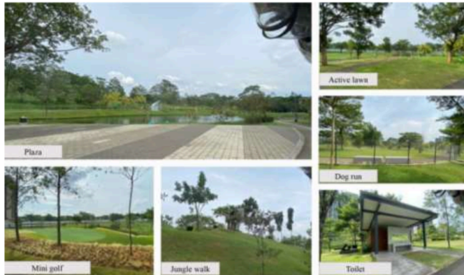
Figure 5. Meandering River Zone

Figure 5 establishes that the Meandering River Zone has done quite well. However, it could still benefit from further improvements. Just like the Serenity Lake Zone, facilities such as fountains and drinking fountains could be added for extra appeal. It is also crucial to enhance the irrigation and drainage systems by installing biopori or infiltration wells to ensure that water is infiltrated before being poured into the lake. A more diverse vegetation, microclimate features such as tall trees with broad leaves, attentive lighting, signages as well as more trash bins could encourage visitors to stay longer in the Meandering River Zone.