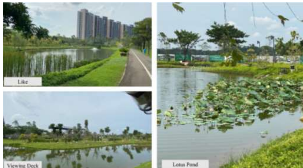
Figure 5. Green Land Zone