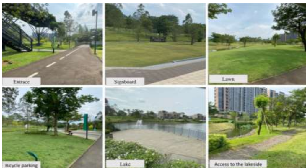
Figure 4. Serenity Lake Zone

Figure 4 shows that the condition of the Serenity Lake Zone is quite good, but it still has room for improvement by adding visual landscape elements, such as fountains as well as drinking fountains. These could provide an identity and a good image for the zone. Arrangement of the vegetation could be more thoughtful, incorporating plants with different colors of flowers to enhance the zone's aesthetics and attractiveness for visitors. Tropical trees that grow tall with broad leaves could also be valuable to control microclimate in the zone. Furthermore, it could benefit from better and lovelier lighting to provide interesting landscape attractions at night. The zone could install signages to clearly divide facilities such as the jogging track, the cycling track, and pedestrian track. Last but not least, more trash bins that are strategically placed are also needed.