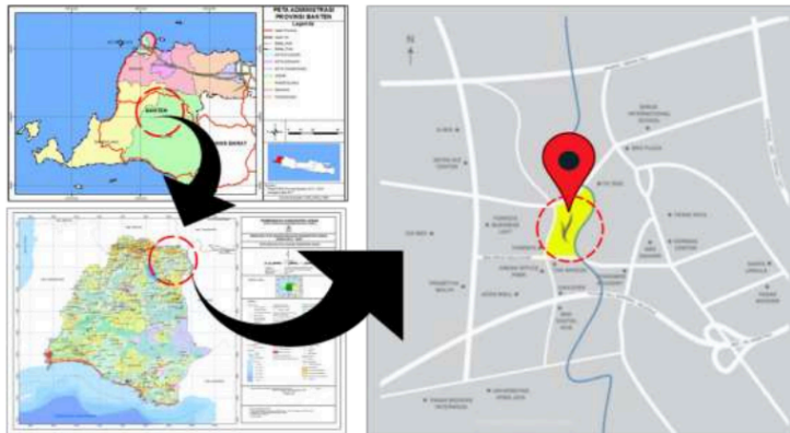
Figure 1. Map of the research location

The research location is the Botanic Park at Nava Park, on Jl. Boulevard Raya, Bumi Serpong Damai, South Tangerang, Banten, Indonesia. The actual scope of the project encompassed an area of approximately 10 hectares, with 40% Building Base Coefficient and 60% Green Base Coefficient. The boundaries consist of Sinarmas Land in the north, Jakarta Nayang School in the south, Damai Indah Golf in the west, and Foresta in the east. Research time: The study was carried out from October 2021 to May 2021, starting with proposal development, conducting the research, and report finalization.