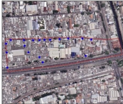
Figure 3. Location of container units.