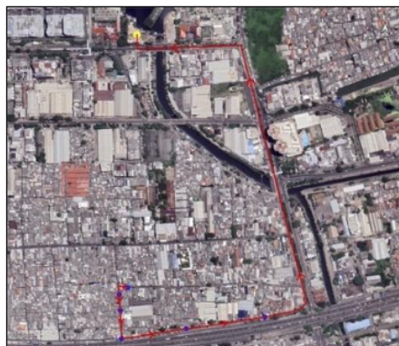
Figure 6. Route collection 2.