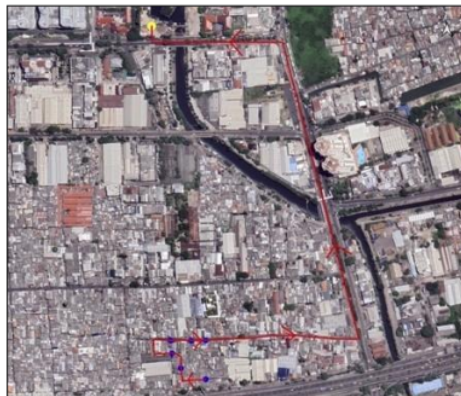
Figure 5. Route collection 2.