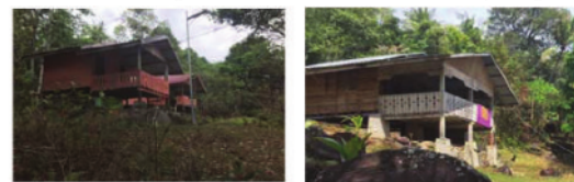
Fig. 10. These buildings used to be lodges

Means of transportation in tourism are very impor-