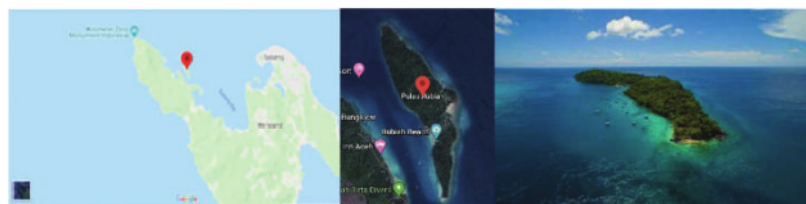
Fig. 1. Map of research location.

b. Tourism approach , conducted by reviewing 5 main elements of tourism: (1) tourist attractions, (2) facilities, (3) infrastructure (4) transportation and (5) hospitality (Spillane, 1987). The element of attraction includes objects of interest at the location. Facilities, transportation and hospitality refer to tourists' needs for a sense of security and comfort dur-