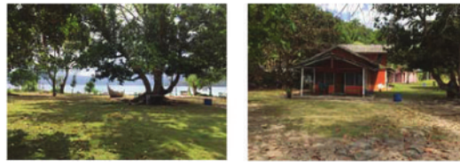
Fig. 5. This area is often used for camping

One activity that cannot be separated from a tourism system is to enjoy the image of the taste of local cuisine or culinary tourism. Culinary tours can be found on the west side of the site near the crossing pier. There are 10 restaurants, stalls or food stalls selling seafood with special spices in Aceh. The price of seafood is very affordable, most visited during lunch. Generally, visitors enjoy this culinary tour while enjoying the coastal panorama, or after they finished swimming and snorkelling.