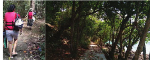
Fig. 9. Pedestrian Path

Tourist facilities are a means to serve and facilitate tourist activities in recreation, Marpaung (2002: 69). According to Bukart and Medlik (1974: 133), although not a major factor, facilities affect the arrival of tourists and in enjoying the tourist attractions of a tourist destination. Thus, tourist facilities are important and needed to serve and facilitate tourist activities in the places they visit. Rubiah Island requires the development of tourist facilities such as administrative offices, security posts, guard posts. Infrastructure development through the provision of clean water channels, provision of electricity, circulation networks that connect objects in the site, communication systems and sewage and sanitation. In addition to accommodating the activities of tourists who play water and swim at the beach, the availability of rinse bathrooms and small rooms