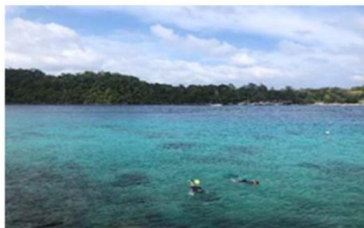
Fig. 3. Natural panorama of Rubiah island

Enjoying the beauty of the Rubiah island in addition to snorkelling and diving is around the island by motorboat for about 2 hours. The boating the glass mat is rented to surround the island to enjoy the vast expanse of the Malacca Strait, a beautiful un-