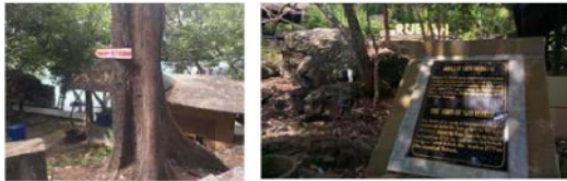
Fig. 7. Tomb of Siti Rubiah