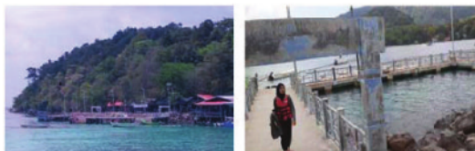
Fig. 11. The main access to Rubiah Island is via the pier

tant so that tourists can move from one place / tourist attraction to another (Pendit, 1986). To get to Rubiah Island, from Banda Aceh use a fast boat or ferry to Weh Island. Travel time using a fast boat for 45 minutes while using a ferry 90 minutes. Arriving at Weh Island, continue the trip to Rubiah Island by motorboat for 20 minutes. Another most practical access is using a speed boat from Iboih Beach jetty to Rubiah Island jetty which only takes 5 minutes.