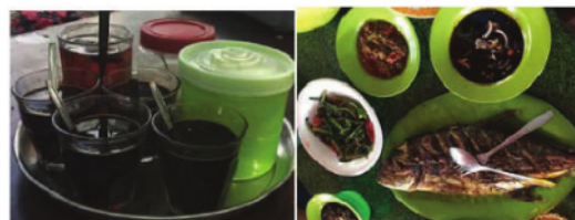
Fig. 6. Food stalls selling drinks and seafood with local flavours seasonings.