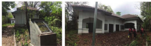
Fig. 4. Hajj Quarantine Buildings

In the eastern part of the island, there is an area that is often used as a camping location for tourists, especially among teenagers. This area has the potential to become a camping ground area due to the relatively flat condition of the site and close to a clean water source such as a well. This area with a stretch of grass is sufficiently maintained because it is managed independently by its owner, Mr. Yahya. Although camping activities are not always found every day, but this area if arranged and managed properly has the potential to increase tourist visits to Rubiah Island.