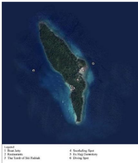
Fig. 8. Map of Rubiah Island Tourism Attraction