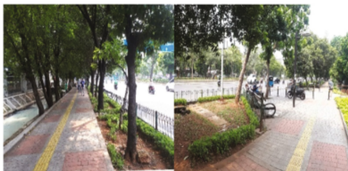
Fig. 2. Existing Condition of Pedestrian Paths.

The picture above shows the existing condition of the pedestrian path on the campus side of Jln. Kyai Tapa, Grogol Petamburan, West Jakarta. The green layout in the pedestrian area looks not optimal; visually, it can be seen that there are a lot of empty