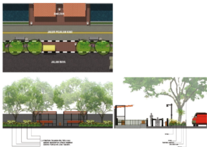
Fig. 6. Recommendations for Green. Planning for Pedestrian Paths

shrubs, and trees, they can also be used as noise absorbers and reduce the light of car lights at night for pedestrians passing by a pedestrian path.