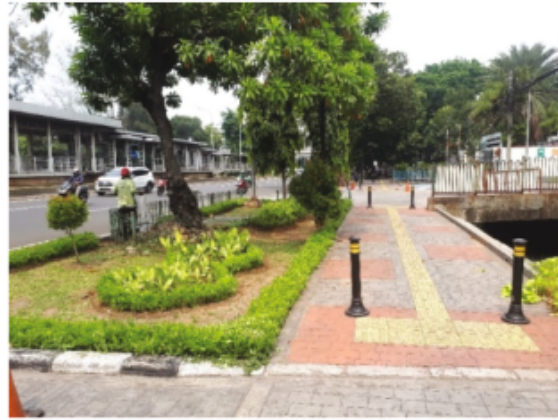
Fig. 4. Existing Condition of Pedestrian Paths

pedestrian path requires various types and dynamic patterns so that the green layout on the pedestrian path can provide a visual improvement in the area.