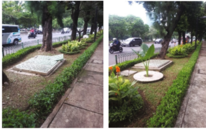
Fig. 3. Existing Condition of Pedestrian Paths.

form of greening along the road, both on the edge of the road and the median. The function of the green element on the pedestrian path is as a safety, and protector, giving direction and providing visual quality to drivers and pedestrians, as well as minimizing air pollution and noise from motorized vehicles.