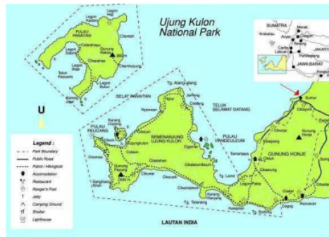
Figure 1. Ujung Kulon National Park

11 Furthermore this paper will discuss on study conducted to evaluate visual landscape for manage the scenic Peucang Island and Ujung Kulon Peninsula.