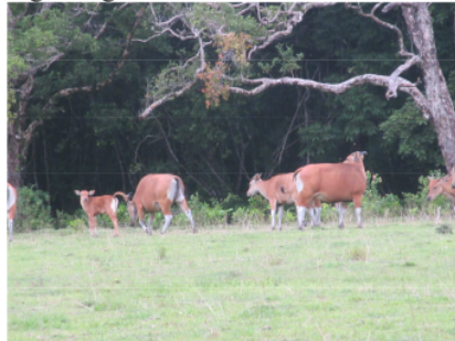
Figure 3. Grazing field

Panoramic view from forest to grazing field