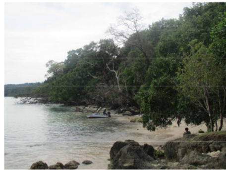
Figure 4. Rocky and sandy beach