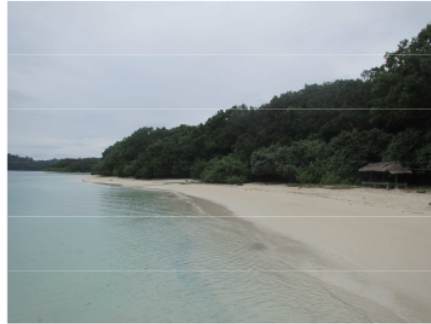
Figure 2. Panoramic view from island and sea

Distinctive view white Sand and coral blue